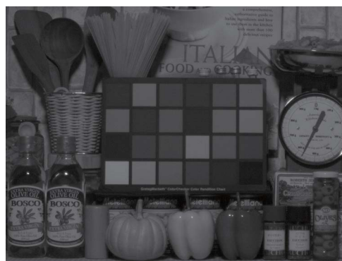
IMX036LLR analog gain: 24 dB