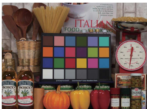
3.2M-pixel all-pixel scan mode (2048 × 1536), analog gain: 6 dB