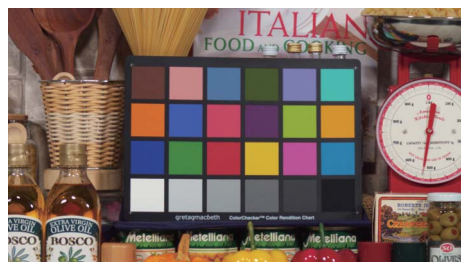
1080p HD mode*1 (1920 × 1080), analog gain: 6 dB

*1 Acquired with center cropping: the optical center is the same as in all-pixel scan mode.